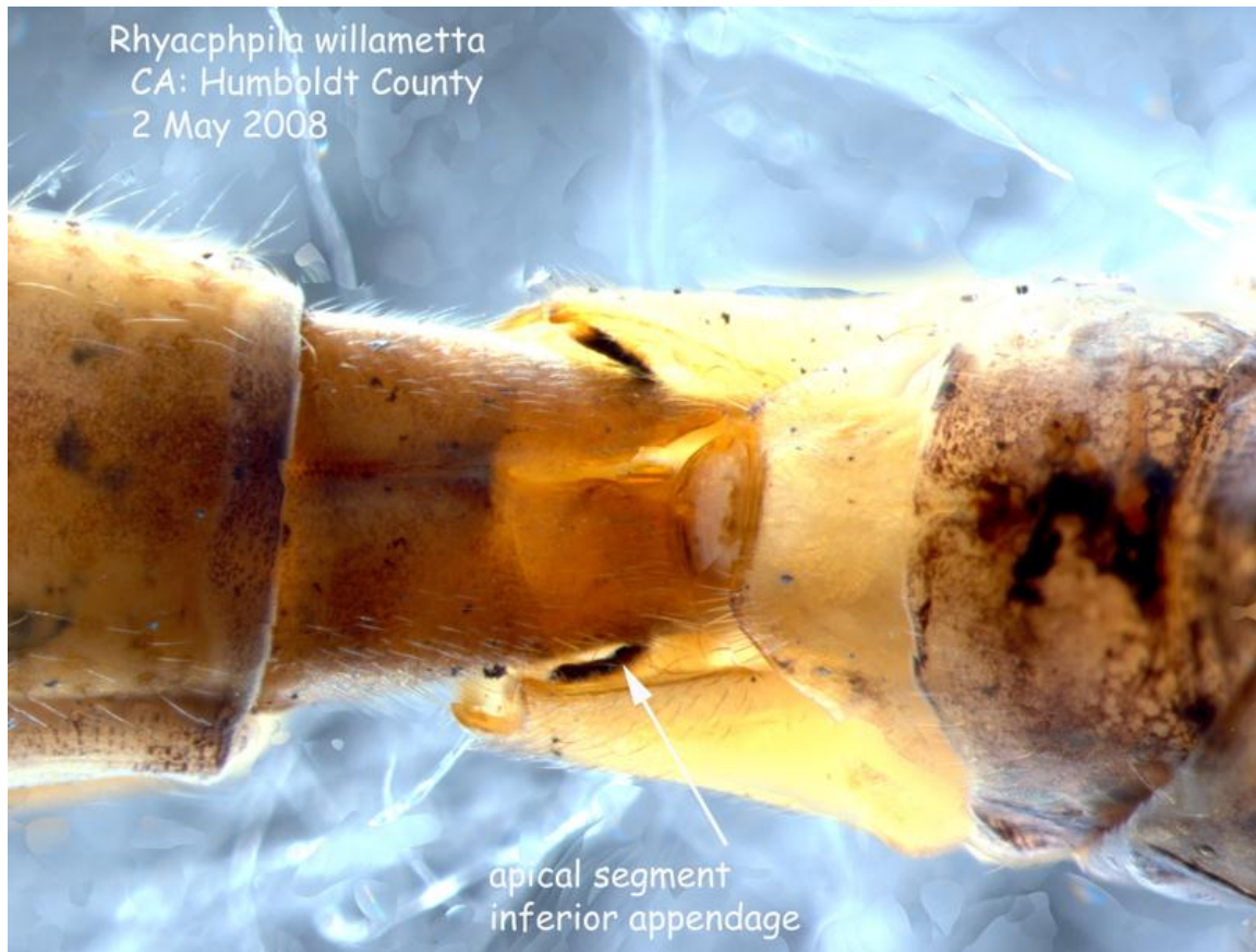
Rhyacophila willametta in copula, dorsal view. Female on left, male on right.