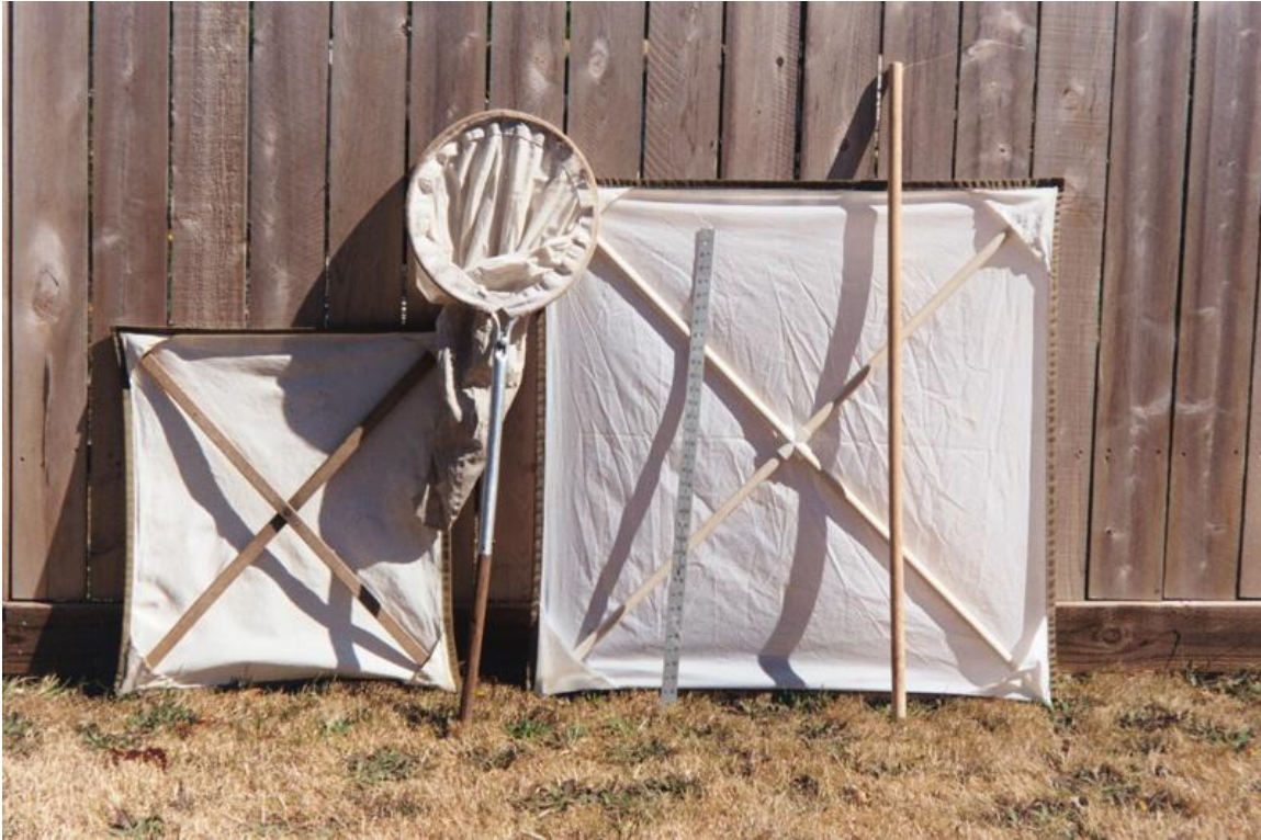
Figure 1. Canvas beating sheet, heavy-duty aerial net with extended handle, nylon beating sheet, and 48" hardwood dowel.

Miscellaneous bug notes (anecdotal notes, including distributional records in the SAFIT region, which may be interesting or helpful to SAFIT members). To make contributions or comments contact the editor: jlee@humboldt1.com .